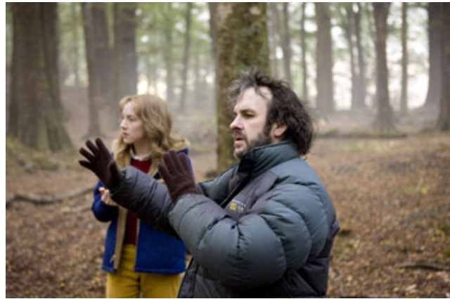
Saoirse Ronan as Susie Salmon and Director Peter Jackson