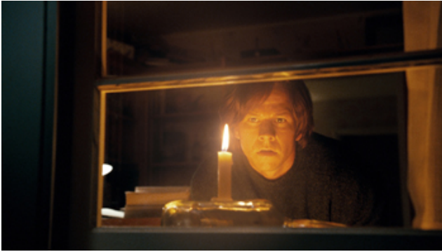
Mark Wahlberg as Jack Salmon