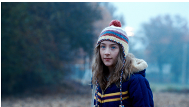
Saoirse Ronan as Susie Salmon

(Click on each image below to see a larger view)