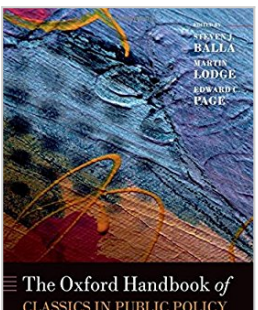
CLASSICS IN PUBLIC POLICY AND ADMINISTRATION